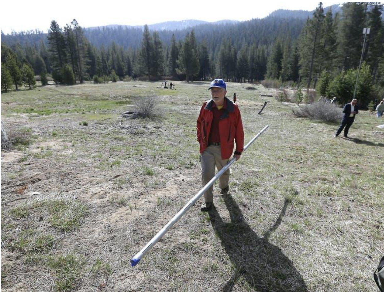
Frank Gehrke, chief of the California Cooperative Snow Surveys Program, carries a snow pack measuring tube near Echo Summit, Calif., on April 1, 2015 – the first time Gehrke found no snow at this location on this date.

Snow droughts also affect the winter tourism industry. Ski resorts in lower-elevation areas with increasingly warm winters may be able to survive one year of poor snow conditions, but multiple low-snow years in a row may threaten their viability.